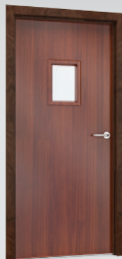
Wood Finished Doors