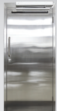
Stainless Steel Doors