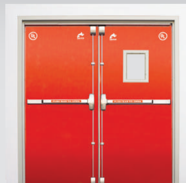
Temperature Rise Rated Doors