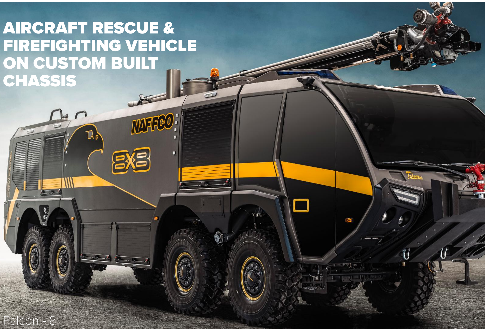
Falcon - 8