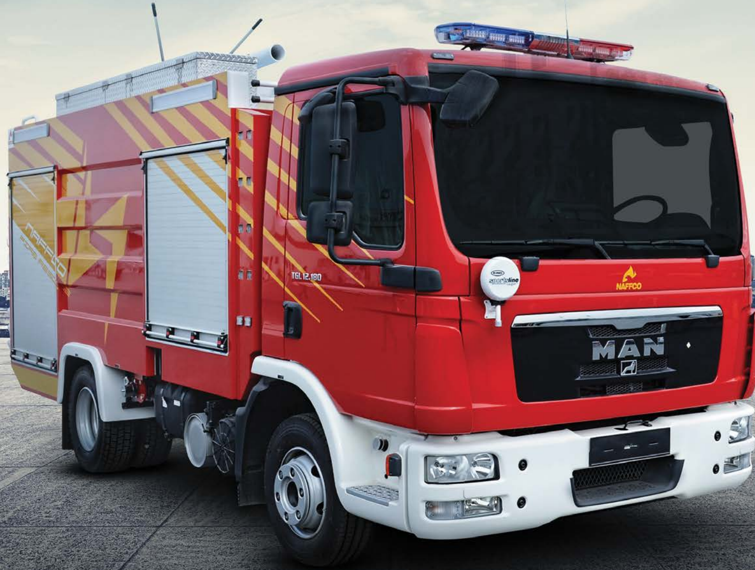
NFM 40/4-SC Light Duty Firefighting Vehicle